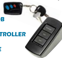
TABLE TOP CONTROLLER